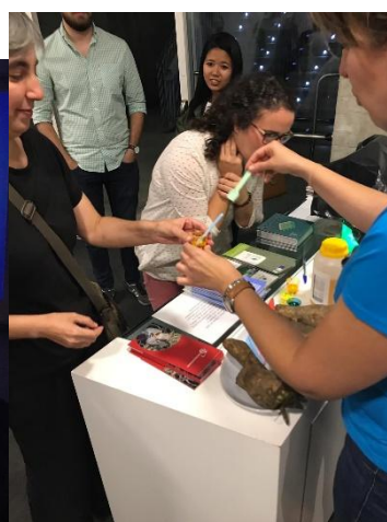
Presentations of IDC in the European Researchers Night- Spain and exhibition of CHIC Project in the European Corner (28th- 29th of September 2018).