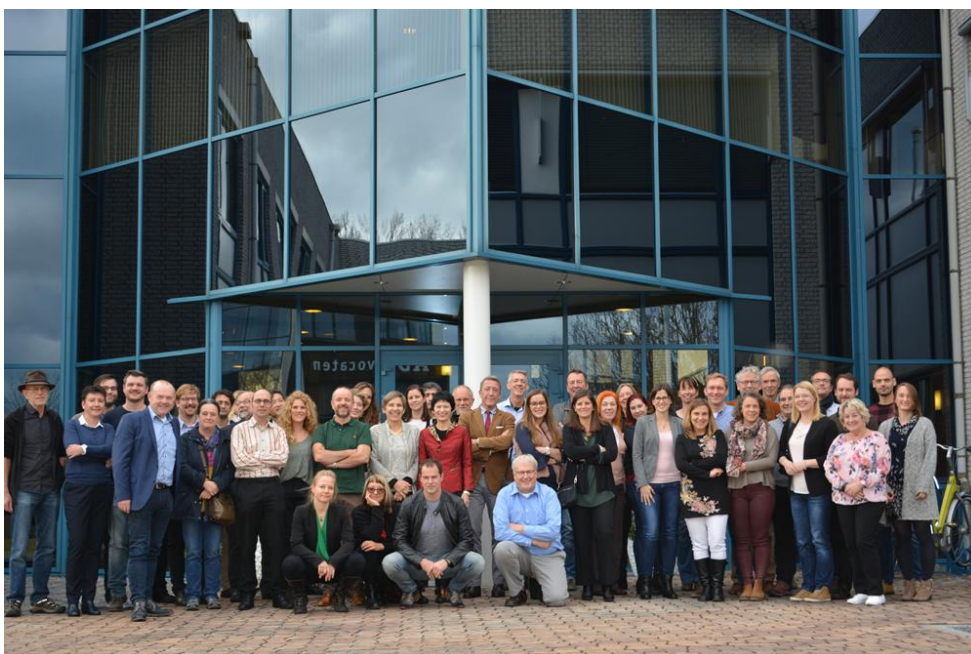
CHIC consortium and stakeholder advisory group meeting held in November 2018 at KEY GENE Premises, Wageningen, The Netherlands.

During the consortium meetings held in January and November 2018, a stakeholder advisory group meeting was organized. Several representatives from all groups (science, industry, consumers, farmers) attended the meetings where interesting discussions happened between the consortium and the advisors.