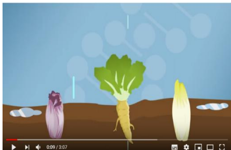
H2020 CHIC project video on Youtube

The communication and dissemination infrastructure had been developed, by creating dedicated social network accounts, the website and the promotion of Art and Science activities: the artists can participate in the joint Artists in Residence programme.