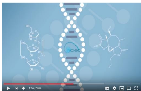
H2020 CHIC project video on Youtube

A video about the project has been released and shared on all the main CHIC's social media accounts and communications channels. ( watch it here )